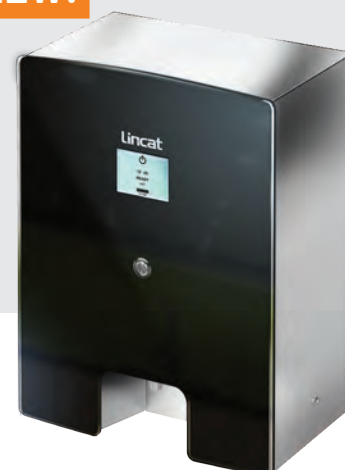
WMB5FX/PB Wall Mounted Automatic Boiler with Touch Screen Control and Push Button Dispense