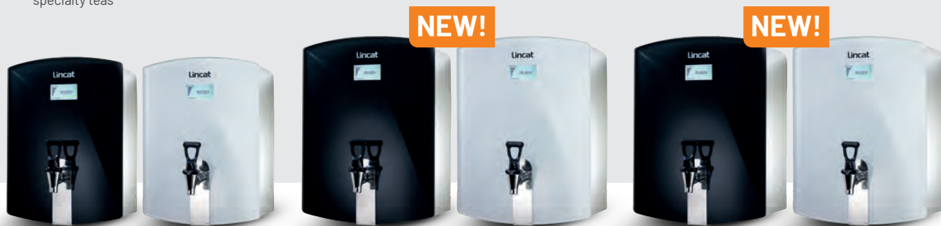
WMB3F FilterFlow wall mounted automatic water boiler